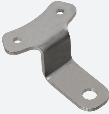
support plate ACC-TOR-ENI90PL-070